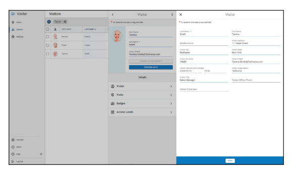
Manage Visitors and Details