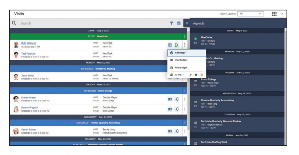
Check-in Visitor and Print Disposable Badge