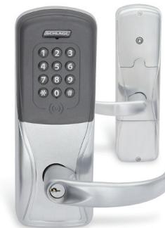
Version 5.2 supports Mercury Security-powered Allegion Schlage AD-300 networked wired locks.