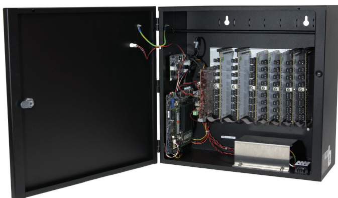
Up to seven LenelS2 Application Blades in any combination can be supported by a Network Node.

Up to seven LenelS2 Application Blades in any combination can be supported by a Network Node. LenelS2 Application Blades are easy to install – Network Nodes automatically recognize and address them without jumpers or switches. Power and communications are delivered to every LenelS2 Application Blade via a ribbon cable bus, and the blade supplies 12VDC, up to 250mA, per card reader.